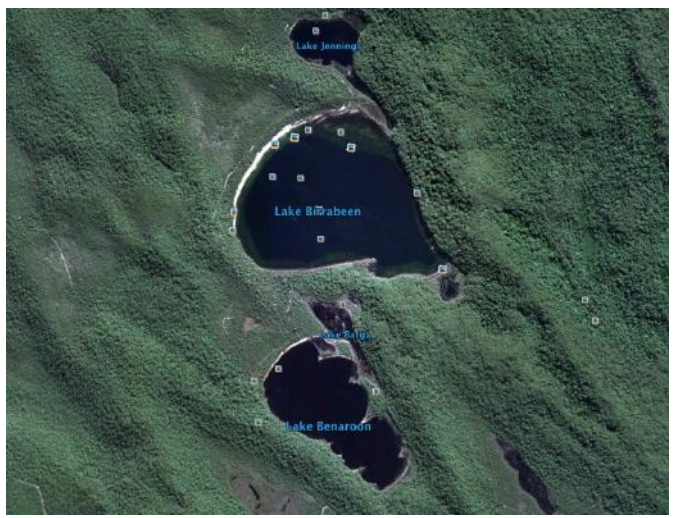
Fig. 2. This photo from Google Earth illustrates three of Fraser Island's dune lakes, Jennings, (top) Birrabeen (centre) and Benaroon (lower)

3. Sand spits: As the littoral currents get further from the main beach they loose energy. With this loss of energy they drop sand. Eventually over long periods, the sand deposited accumulates to form spits. Because these spits take hundreds, indeed thousands of years to create, they are evidence of the age of the lake. In the case of Lake Benaroon the spits are very pronounced and reach out to each other from opposite sides of the lake indicating a great age of this lake that is less exposed to wind than the adjacent Lake Birrabeen. Figure 2 shows that Lake Benaroon has several spits that are creating segments in the lake and the beaches on the sand spits provide further sand to create other spits upwind. Lake McKenzie (Boorangoora) has a very significant spit.