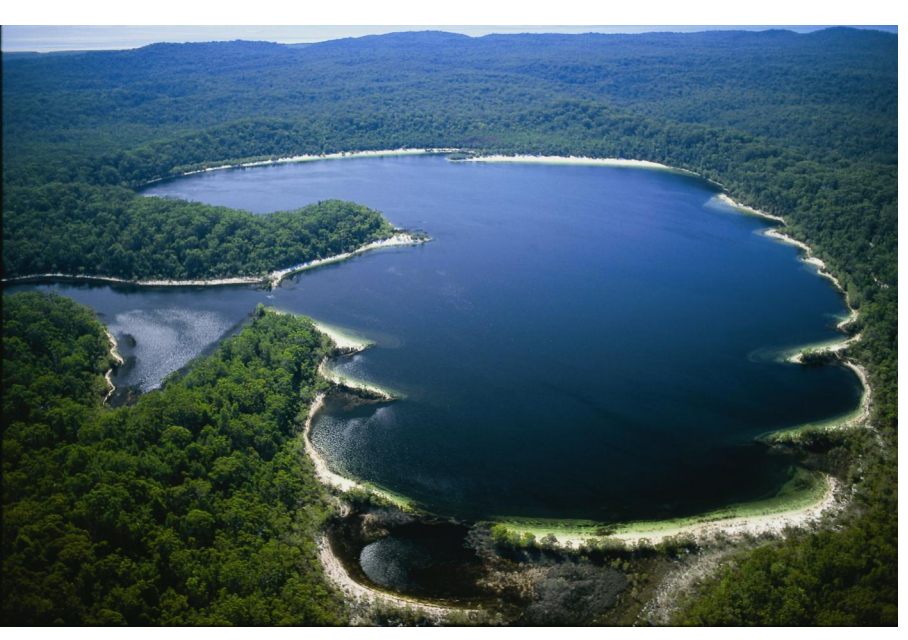
Above: Lake McKenzie (Boorangoora)

Size. Lakes that are so small there isn't much surface to raise more than а ripple on are little affected by the of forces the This is wind. even less so if they are sheltered from the wind. However it is inevitable that the wind when strong enough will have impacts on the larger lakes such Boomanjin. as The heaviest